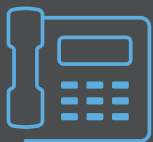
Voice (Fixed or Mobile)