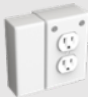
BLE beacon with aggregator